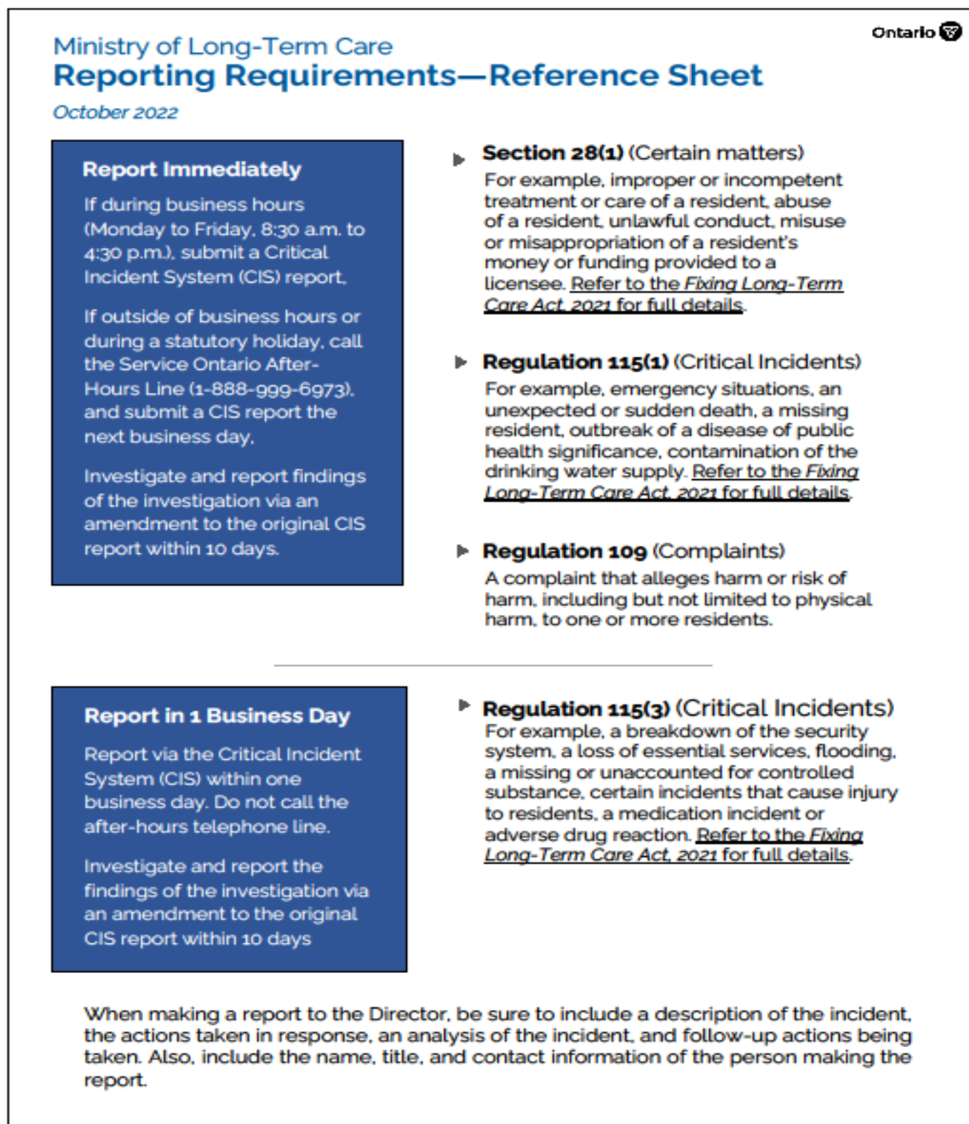
TABLE 1: MLTC Reporting Requirement – Reference Sheet